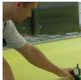
mesh tensioning check